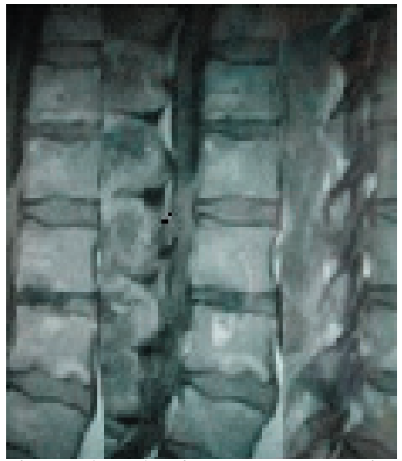
Figure 1. T1-weighted MRI showing hypointense fragmented disc at Th12-L3 level

1. Congenital narrowing of the spinal canal with less epidural space, 2. Adhesions between the annulus fibrosus, posterior longitudinal ligament, and duramater, 3. Congenital and iatrogenic fineness of the dura mater (1,4,5).